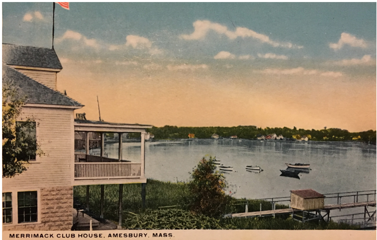
Amesbury Carriage Museum, Postcard Collection.

Special event co-sponsored with Lowell's Boat Shop, the Piscataqua Gundalow and Massachusetts Highway Department